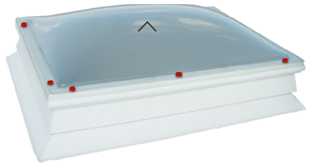
Hailstop, Super Top, PET-TOP

High-impact resistance Increased resistance against vandalism