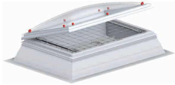
LK-DDN, installed on a GRP upstand with dome rooflight, ventable