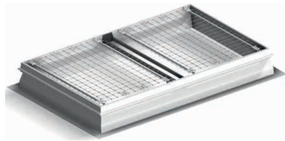
LK-DDN for SHEV dome rooflight