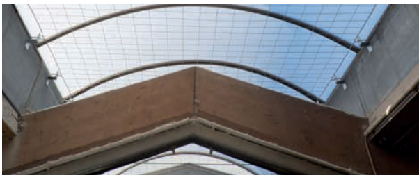
Type LB-DSL 600 J