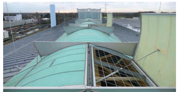
GRILLODUR® DSG in a double flap

With the appropriate certification in accordance with GS-BAU-18, the GRILLODUR® DSG fall-through protection is able to fulfil the high requirements of the employer's liability insurance association for the construction industry.