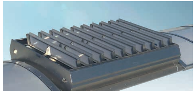
VARIO continuous rooflight with louvered smoke ventilation

A range of customisation options are available, allowing the system to be adapted to customer and project requirements. Feel free to contact us, we will find the right solution.